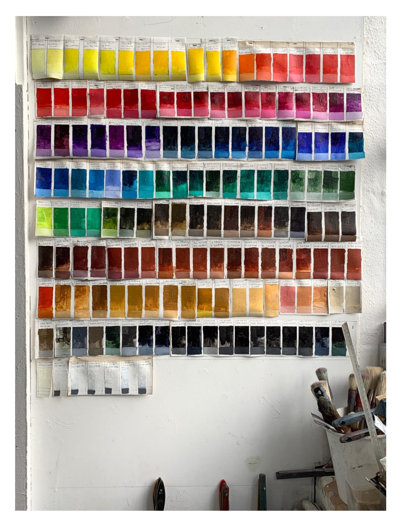
Therefore this exercise came as a necessity and is a visual shortcut for the paints I have and helps with my bad habit of buying and trying every new paint/pigment I find.