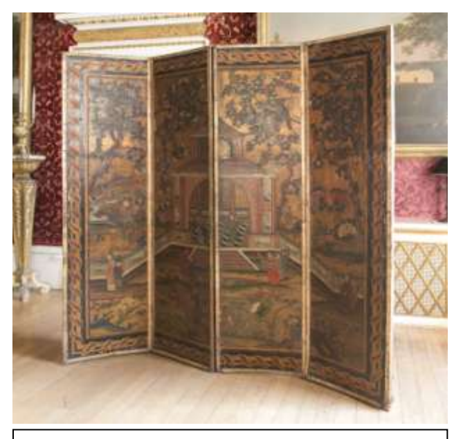
'Chinese' Screen, painted and gilded leather, early eighteenth century.