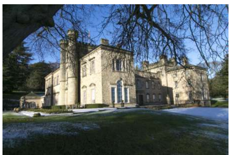
Aske Hall, North Yorkshire, December 2012.

Please note that this case study was first published on blogs.ucl.ac.uk/eicah in February 2013. For citation advice, visit: <u>http://blogs.uc.ac.uk/eicah/usingthewebsite</u>.